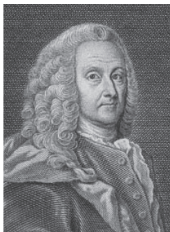
L. Holberg

This design is part of a little collection inspired by the works of the famous Danish-Norwegian poet and author Ludvig Holberg . Holberg lived from 1684-1754, and even though this is a long time ago, he had a very special talent for showing – and exposing – different types of people, which is a big part of what makes him relevant still today.